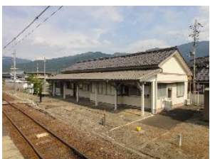
Tomura Station, opened 1917