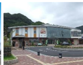
Wakasa-Takahama Station ②

A ride on the Obama Line brings passengers past the Five Lakes of Mikata and Wakasa Bay, through endless fields and forests, and countless other views both soothing and stimulating. Its stations range from the storied Tomura Station (built in 1927) to the modern Wakasa-Hongo and Wakasa-Takahama Stations. After hosting the International Gardening and Greenery Exhibition, the “pinwheel station” used for the conference was relocated, becoming Wakasa-Hongo Station, a beautiful example of modern local railway architecture.