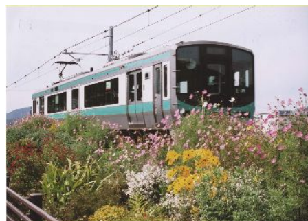
Flowers in bloom along the Obama Line (Goichi, Mihama-cho)