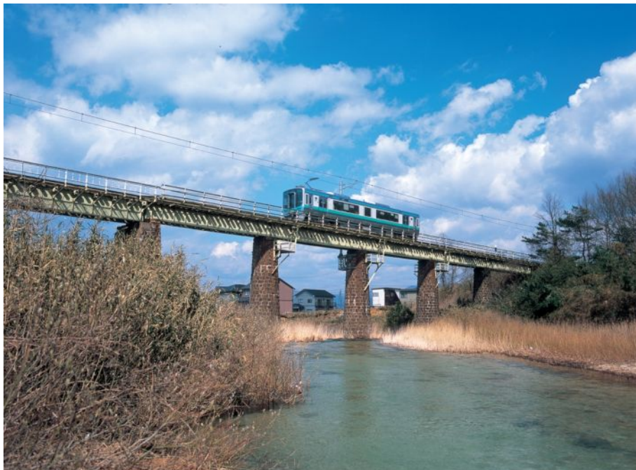
Obama Line crossing the Kuroko River Bridge (Tsuruga City)