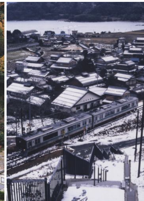
Obama Line through snowy townscapes (Nishisei, Obama City)