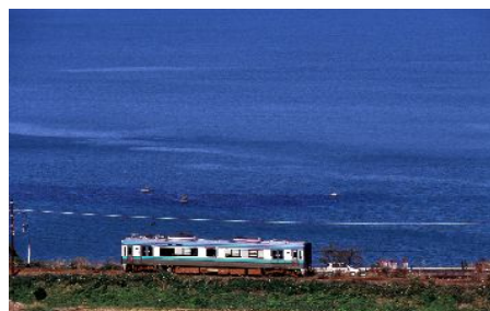
Obama Line train travelling along Obama Bay (Higashisei, Obama City)