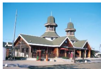
Wakasa-Hongo Station ①