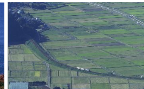
Train passing through the fields (viewed from atop Mt. Sanjūsangen)