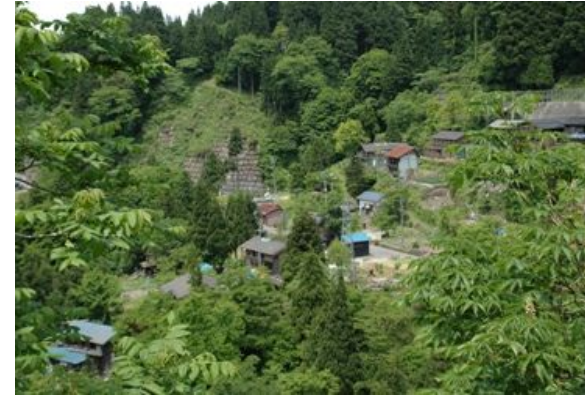
Ohara settlement, built on the mountain's steep slope ③

The Ohara settlement sits at the entrance to Mts. Akasagi (elev. 1,629m) and Ochō (1,671m), at an elevation of 500m. Cut into the steep mountain slope, narrow openings create a compact living area that maximizes scarce space.