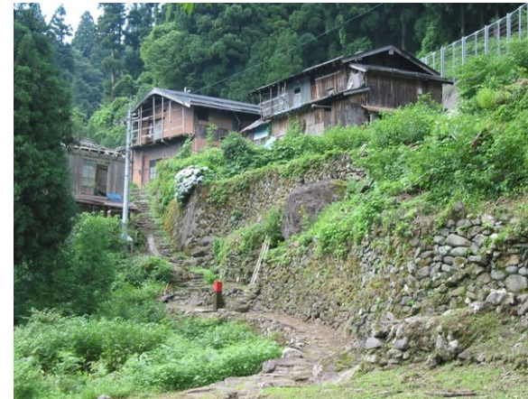
House atop a stone wall ④

In order to preserve this historic area, local residents are actively involved in conservation and restoration efforts. University students have been important participants in this, and under the guidance of master carpenters learn the traditional construction techniques used to build and maintain the homes.