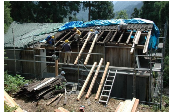
University students undertaking roof repair and reconstruction ⑤