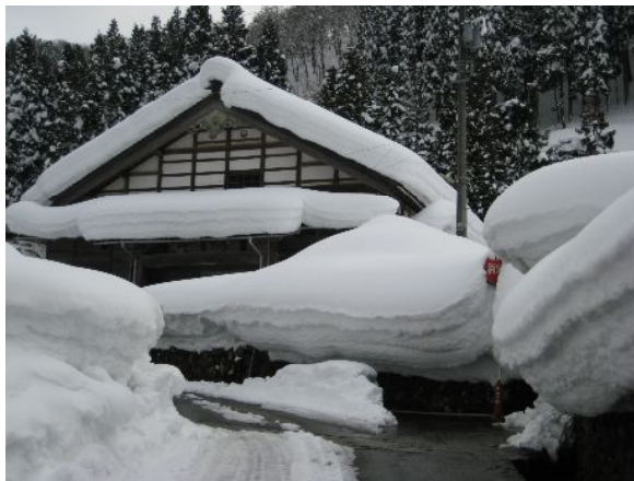
Kinehashi, steeped in snow ②

In Kitadani-cho, near the border with Ishikawa Prefecture, hamlets dot the terraces made by the Takinami River's flow. Kinehashi, one of Kitadani's 7 settlements, the white walled-homes and earthen walls have long defined the settlement, and the firewood so central to residents' winter lives can be found everywhere. Known for its tremendous snowfall even within the prefecture, the roof of each house needs to be cleared of snow several times in a normal year.