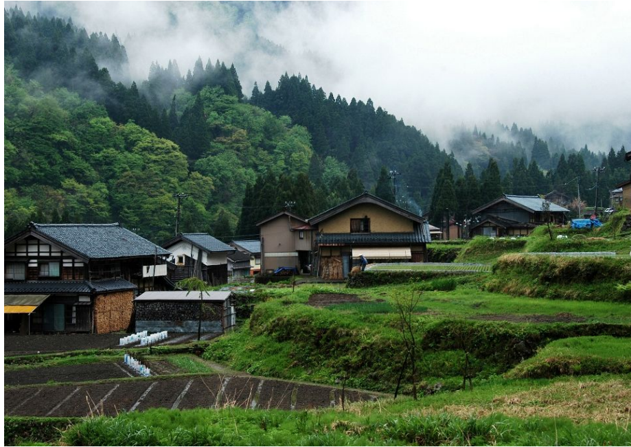
Kitadani's Kinahashi settlement ①

In Kitadani, more than 1 meter of snowfall can accumulate in a single evening. Its resident patiently await the thaw, and time stands serenely still.