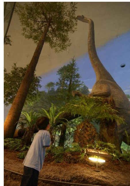
Inside the museum