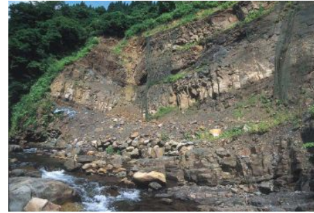
Fossil excavation site (Sugiyama, Kitadani-cho, Katsuyama)

Sugiyama, Kitadani-cho site has yielded more dinosaur fossils than any other site in the country. At the Katsuyama Dinosaur Forest, visitors can try their hand at fossil excavation with rocks brought from the Sugiyama site. In 2009, the entire Katsuyama area was designated as the Dinosaur Valley Fukui Katsuyama Geopark to preserve its natural beauty and promote awareness of the importance of geo- and bio-diversity.