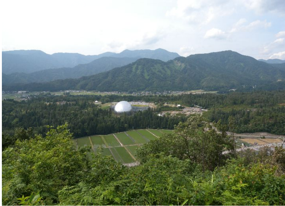
The Dinosaur Museum, as viewed from the peak of Mt. Muroko ①

Trekking to the land where dinosaurs once roamed, the egg-shaped Dinosaur Museum comes into view; close at hand are a treasure trove of fossil excavation sites. A step inside brings visitors back in time to the age of giants.