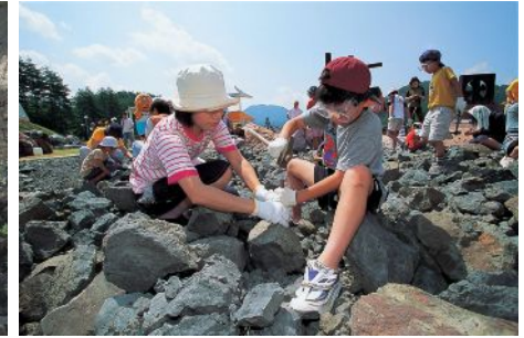
Hands-on fossil excavation ③