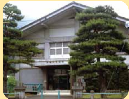
Paper and Culture Museum