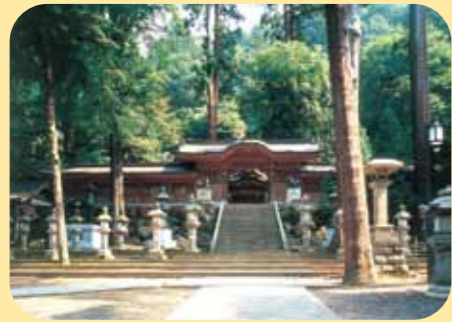
Shisojin Okamoto Shrine and Otaki Shrine