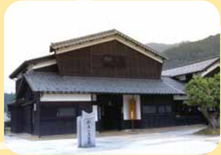
Udatsu Paper and Craft Museum