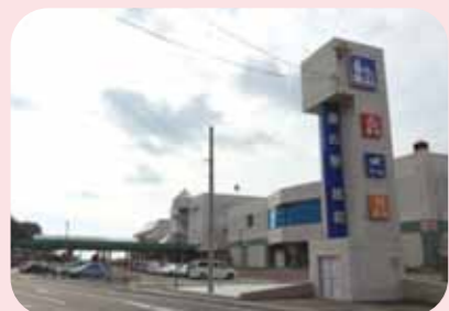
Echizen Road Station