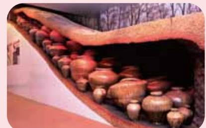
Fukui Prefectural Museum of Ceramics TEL:0778-32-2172