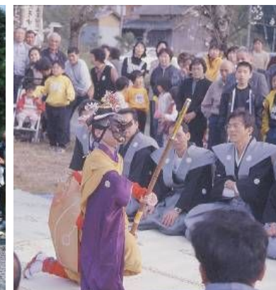
Ō no Mai at Kurami Shrine (Pref. Folk Cultural Property) ④