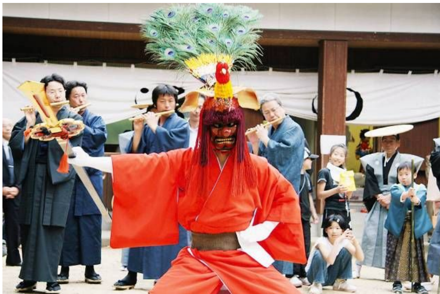
Ō no Mai performance at Mimi Shrine (Prefectural Folk Cultural Property) ①

A dancer wearing a tengu mask displays his skills with flourish at the local shrine. Along with the sounds of accompanying flutes and drums, this performance heralds the arrival of spring to Wakasa.