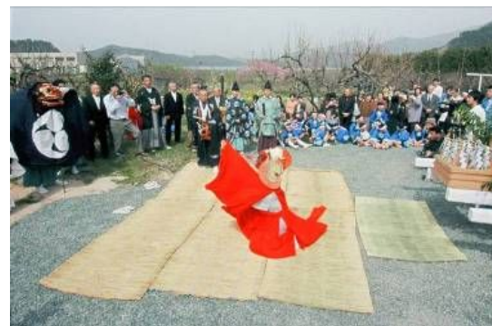
Ō no Mai performance at Tayuhi Shrine (Prefectural Folk Cultural Property) ⑤