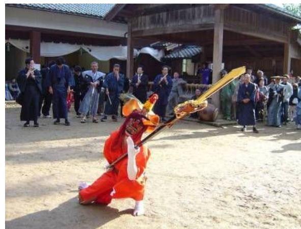
Ō no Mai at Mimi Shrine ②

Every May brings a performance of the Ō no mai , a traditional dance featuring a man dressed as a tengu (a common character in Japanese folklore) is performed at Mimi Shrine in Mihama-cho's Miyashiro district. It is said that this dance's origins lie with the imperial family, and several shrines throughout Wakasa hold performances of it.