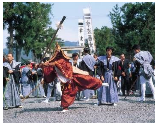
Ō no Mai at Uwase Shrine (National Intangible Folk Cultural Property) ③

The form and purpose of Ō no Mai varies from region to region, and is an indelible part of spring ritual in the Wakasa area.