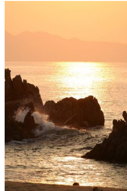
Sunset on Suishohama ②