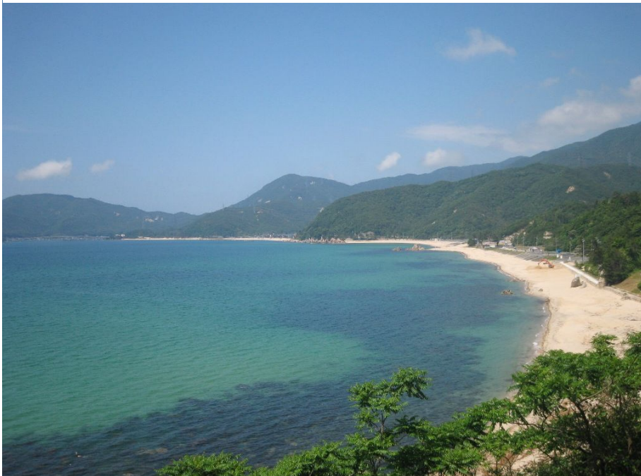
Suishohama, as viewed from Bentenzaki ①

A walk along this glittering stretch of shoreline leaves one confident that the town's name, which means "beautiful shore," is by no means undeserved.