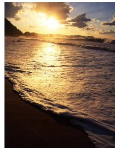
Sunset at Diamond Beach ③

With the setting of the sun in the closing days of the Obon festival, it is said that fall finally comes to Mihama.