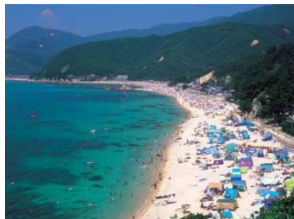
Suishohama, packed with swimmers