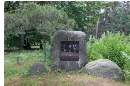
Stone monument bearing a poem by Takahama Kyoshi

On an imperial tour of the Hokuriku Area, Emperor Meiji praised the beach's beauty and that of its view. Upon visiting the beach himself, samurai-turned-government-official Katsu Kaishū captured in verse the Emperor's visit and the breathtaking view he enjoyed. Other noteworthy figures, such as poet and novelist Takahama Kyoshi, praised this site for its unforgettable vistas.