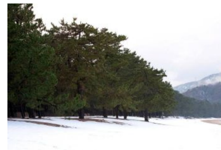
Kehi no Matsubara in winter

On an imperial tour of the Hokuriku Area, Emperor Meiji praised the beach's beauty and that of its view. Upon visiting the beach himself, samurai-turned-government-official Katsu Kaishū captured in verse the Emperor's visit and the breathtaking view he enjoyed. Other noteworthy figures, such as poet and novelist Takahama Kyoshi, praised this site for its unforgettable vistas.