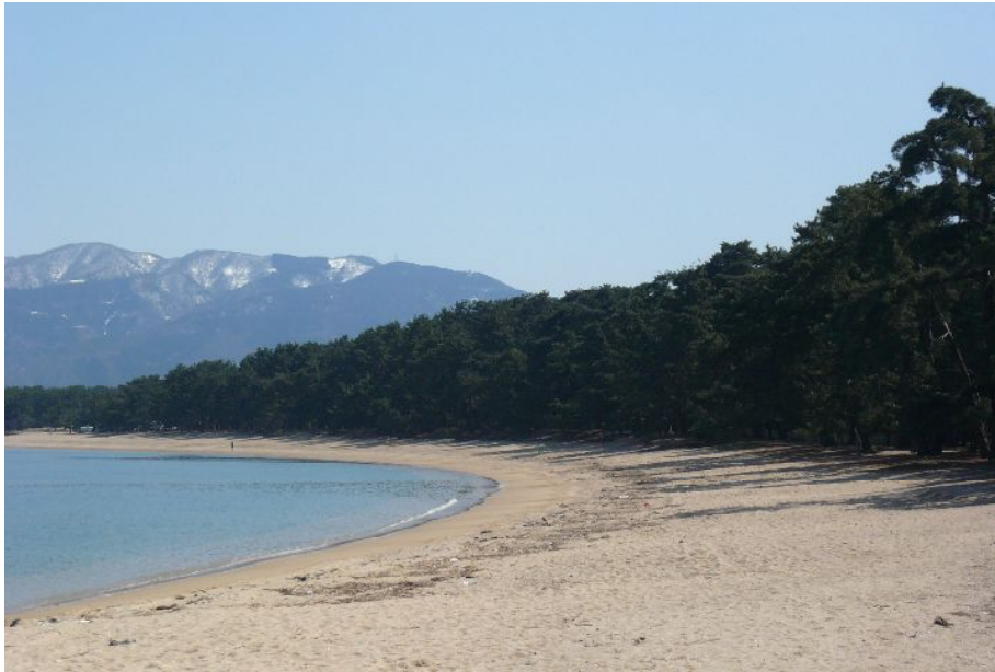
Kehi no Matsubara Beach (Nationally Designated Scenic Spot) ①