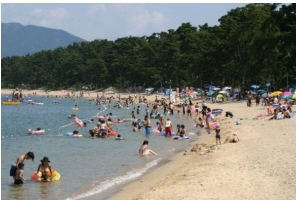
Summer at the beach ②

Alongside Miho no Matsubara (Shizuoka Prefecture) and Niji no Matsubara (Saga Prefecture), Kehi no Matsubara is one of the three largest beach areas in Japan. The view created by its white sands and 17,000 pine trees have earned it national recognition as a place of scenic beauty. Beachgoers from the surrounding areas, from Kyoto to Osaka to the Nagoya area, come to enjoy its beauty unique to each season.