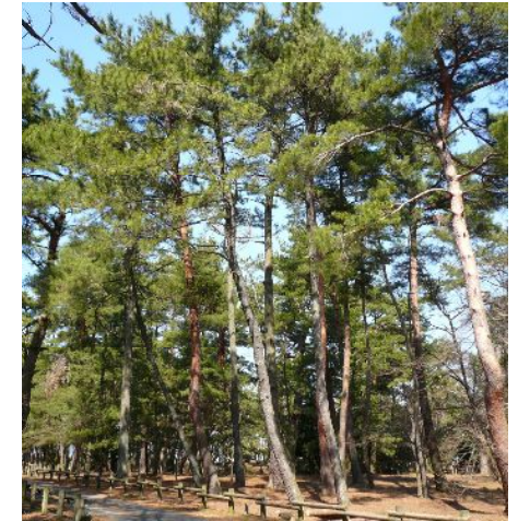
Pine grove walking path ④