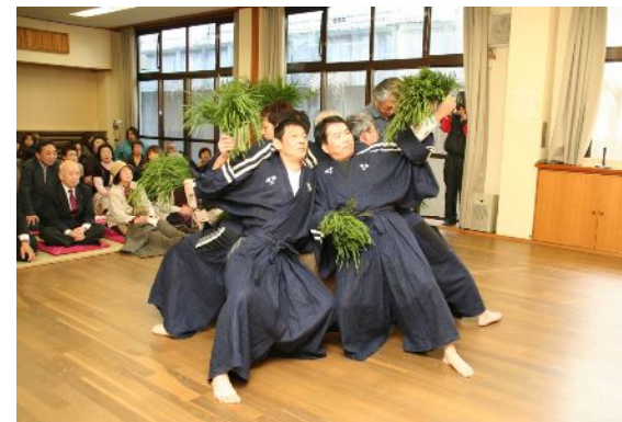
Danose Festival (Prefectural Folk Cultural Property) ③

On the 8 th day of the 1 st month of the lunar calendar, the Danose Festival, which prays for bumper crops, has been held at nearby Nosaka Shrine since the Muromachi Period.