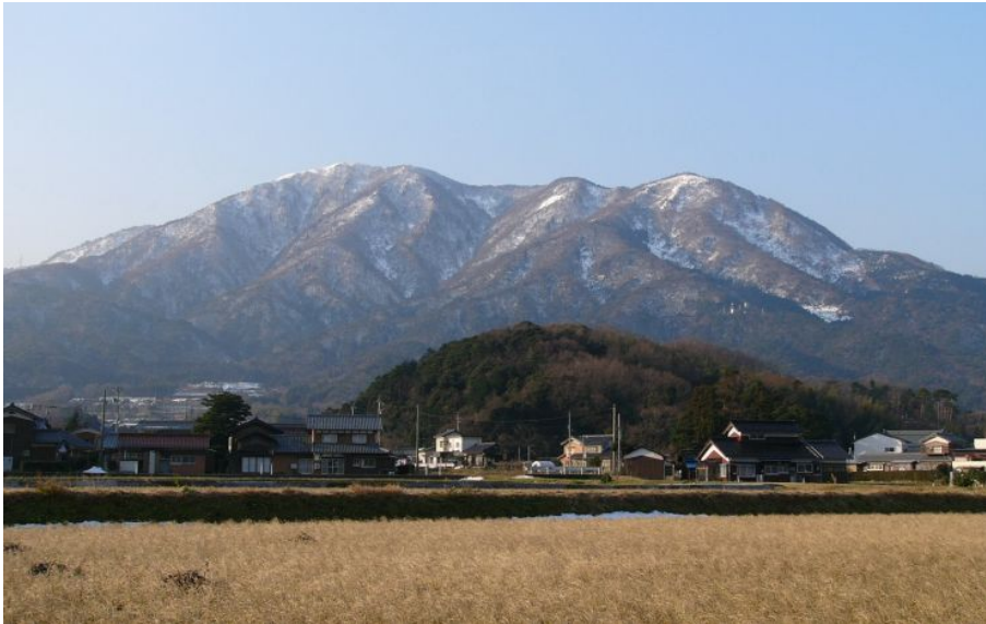
Mt. Nosaka ①

The view from atop Mt. Nosaka, the highest peak in Tsuruga, is unparalleled: to the north lies Tsuruga Bay; to the south, Lake Biwa; to the west, the Five Lakes of Mikata.