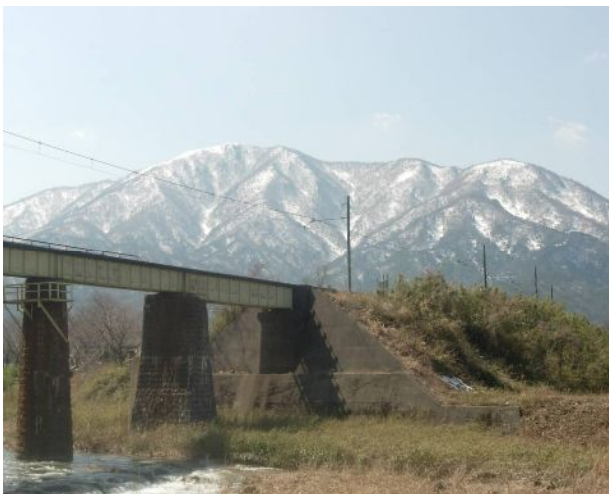
Mt. Nosaka, overlooking the Obama Line

Towering over the southwestern edge of Tsuruga is Mt. Nosaka (elev. 914m), said to have been a favorite of the great priest Kōbō. Owing to its appearance changing little from every angle, it has come to be known as the “Mt. Fuji of Tsuruga,” and its beauty has been renowned for generations. The 2-hour hike to its summit presents hikers with an unobstructed panoramic view of the entire city and surrounding area.