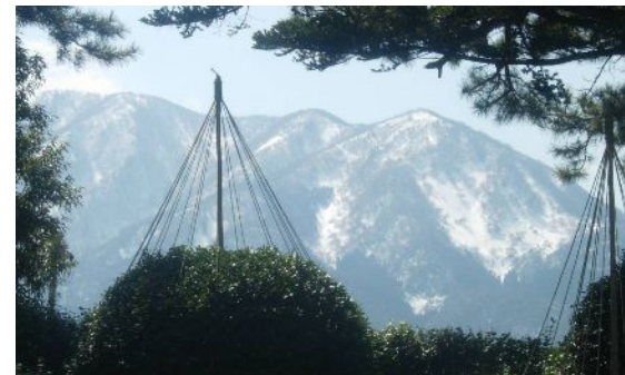
Mt. Nosaka as viewed from Shibata Park (Nationally Designated Scenic Spot)

Shibata Park, a strolling garden built in the early Edo Period, was constructed in such a way as to capture a view of the mountain from its paths.