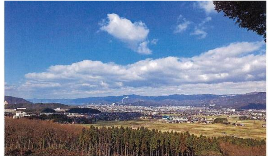
Tsuruga City as viewed from atop Mt. Nosaka ②

Towering over the southwestern edge of Tsuruga is Mt. Nosaka (elev. 914m), said to have been a favorite of the great priest Kōbō. Owing to its appearance changing little from every angle, it has come to be known as the “Mt. Fuji of Tsuruga,” and its beauty has been renowned for generations. The 2-hour hike to its summit presents hikers with an unobstructed panoramic view of the entire city and surrounding area.