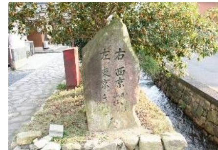
Road marker denoting the area as a major juncture 2