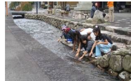
Playing in the Funa River