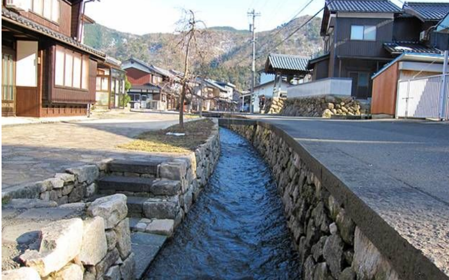
Funa River as it runs through the streets of Hikida

Along the Funa River, the narrow lanes of houses in Hikida bustled with shipping moving through the town. The town's history is that of the river, growing and prospering along this important local cargo route.