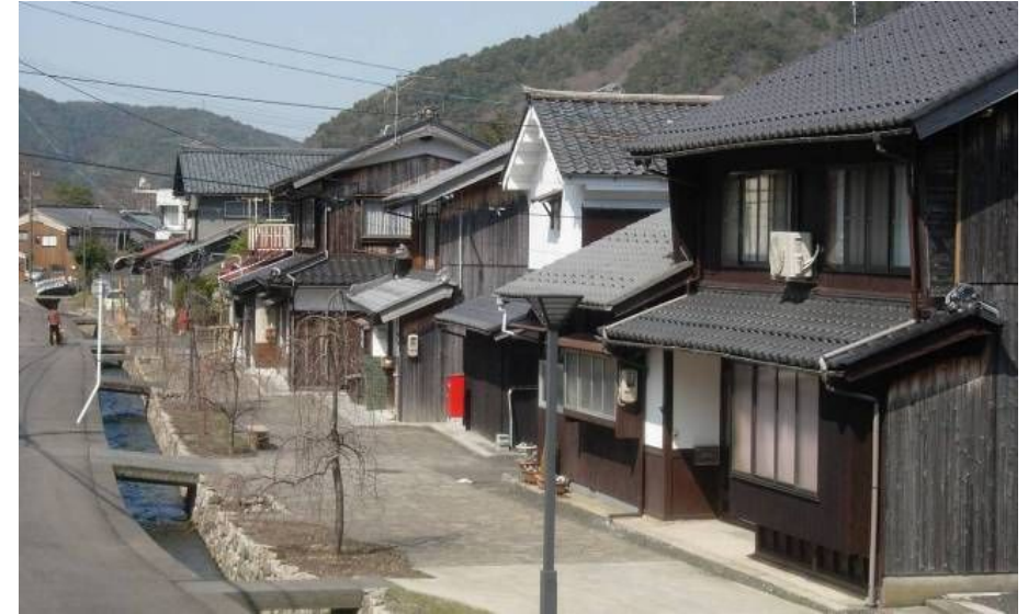
Traditional homes along the Funa River in Hikida

With a low river height owing to its fast flow, shipping along the Funa River was aided by the use of logs along its floor to allow ships heavily laden with cargo to slide along the canal without catching on the bottom.