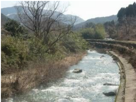
Mid-stream on the Shō River

The Hikida district, which developed as a lodging town during the Edo Period, still finds at its center the rivers and waterways that ran through it centuries ago. Among them is the Funa River, a canal built to ferry goods from Tsuruga Bay to Kyoto as well as the boats carrying them. Travelling upstream along the Shō River brings into view mountain peaks as the river's flow quickens toward its origin.