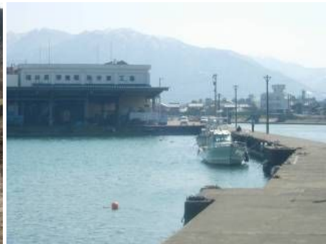
Mouth of the Shō River and entrance to its canal