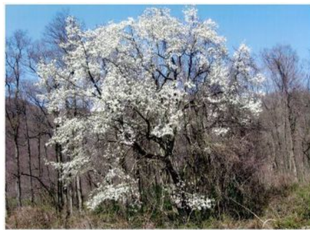
Kitakobushi magnolia tree blossoming in spring