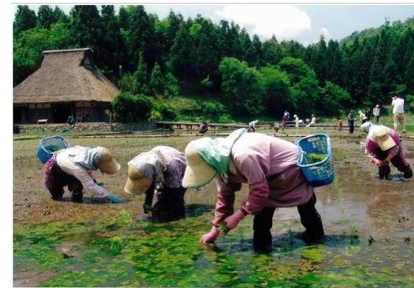
Farming in Nakaikemi

Nakaikemi, which borders the eastern limits of Tsuruga, is bordered by Mt. Tedsutsu and comprises an area of 25 hectares guarded by mountains. From the gentle sounds of its breezes, to the sounds of field birds and insects, to the scents of its trees, it offers delights unique to each season. Residents of its thatched roof houses live in harmony with nature, preserving their surroundings as they maintain an age-old way of life.