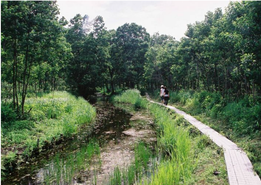
Ike no Kouchi Wetlands

The wildlife of these wetlands lives much as they did in times long past, largely untouched by human hands and changing only with the seasons. Flora and fauna abound in the sanctuary of natural wonders, guarded by nearby mountains and those who live nearby.