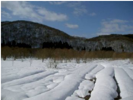
Ike no Kouchi awaiting spring

At the source of the Shō River, which winds through Tsuruga City, lies the Ike no Kouchi Wetlands, a preserve surrounded by mountains and largely untouched by human hands. Known also as Awara ga Ike, it is beloved by residents of Tsuruga as a veritable wildlife paradise.