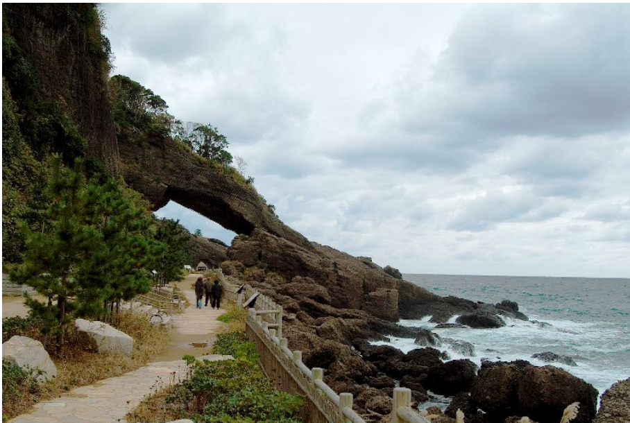
Kochōmon (Nashi ga Daira, Echizen-cho)

The power of the rough seas and sheer scale of the unique rock formations sculpted by them over thousands of years are an unforgettable sight for anyone who was visited the Echizen Coast.