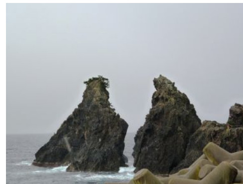
Futami ga Iwa, a frequent resting place for birds (Umeura, Echizen-cho)

Many resort facilities along the coast offer outdoor baths from which to view the sunset, as well as a number of beaches and other vantage points from which to watch the sun slowly disappear across the Sea of Japan.