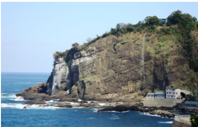
Torikusoiwa (Nashi ga Daira, Echizen-cho) ①

The submerged shoreline of the Echizen Coast stands in stark contrast to that of Wakasa Bay, a rising shore along the Kaburagi Fault. Assailed by surging waves, various unique formations, such as the Kochōmon and Kurikusoiwa , have been slowly carved into the rocky coast through gradual erosion over countless years.