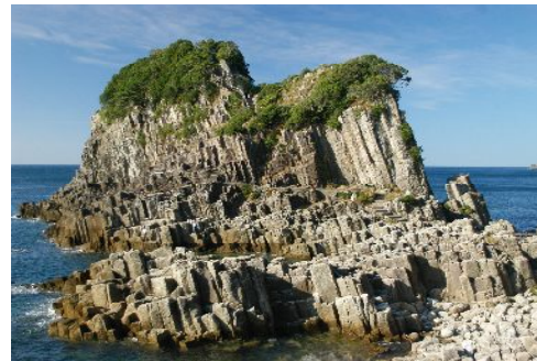
Hokojima, an island of pillared joints (Minami Sugō-cho, Fukui City)

Located nearby is the 100m sheer cliff face of the Torikusoiwa , which marks the extremity of the shoreline's above-water section.