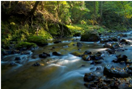
Asuwa River (Shidsuhara, Ikeda-cho)

Mt. Kanmuri (elev. 1,257m), which sits on the border of Fukui's Ikeda-cho and Gifu Prefecture, has been selected as one of the "100 Nature Spots to be Preserved in the 21st Century." Covered in snow and inaccessible for much of the winter and spring months, in early summer its summit opens up to hikers and proudly proves its worth as one of the top 100 Nature Spots in the country. Its brilliant flowers and fall foliage allow visitors to forget the stresses of city life and enjoy reprieve along its slopes.