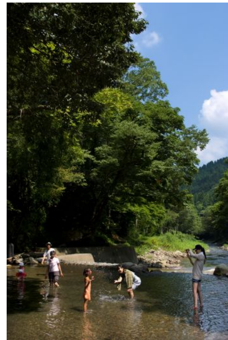
Asuwa River (Shidsuhara, Ikeda-cho)