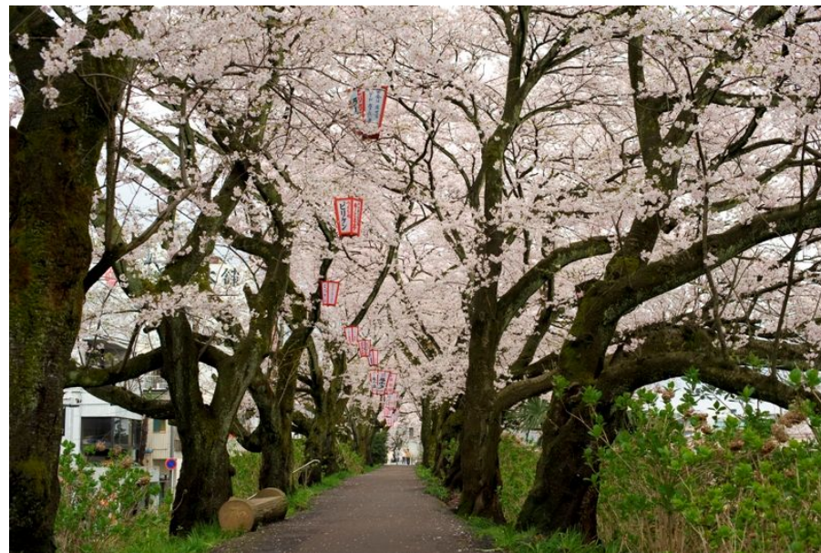
Asuwa River, near Tsukumobashi Bridge

From Kidabashi to Akaribashi Bridge stretches a 2km-long canopy of cherry blossom trees along the southern bank of the Asuwa River. Spring transforms this grove into a resplendent tunnel of pink petals, earning it a place as one of Japan's 100 best spots for viewing cherry blossoms. Begun in the Meiji Period thanks to donations from local residents, it was restored after damage in war, earthquakes, and flooding, overcoming years of disasters to grace the banks of Fukui's central river with its brilliant blossoms in spring.