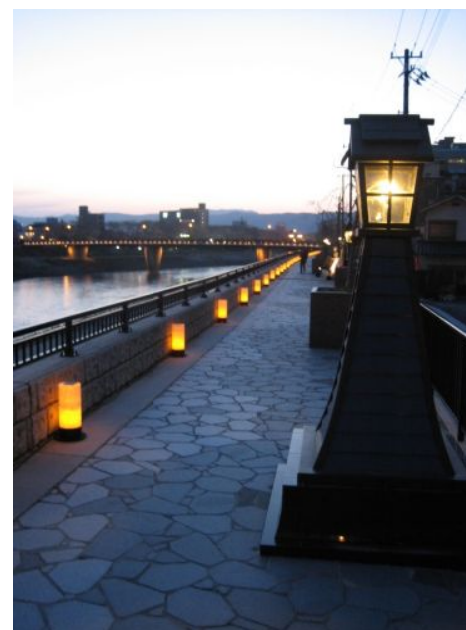
Stone walkway along the river (Hama-machi)