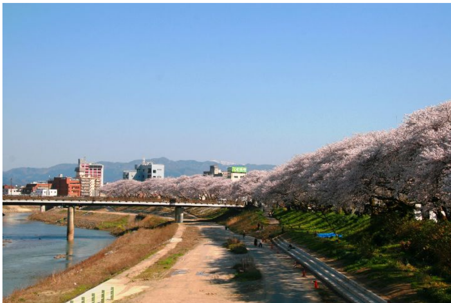
Asuwa River, near Sakurabashi Bridge ①