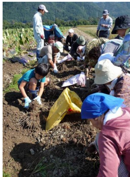
Digging up taro ④