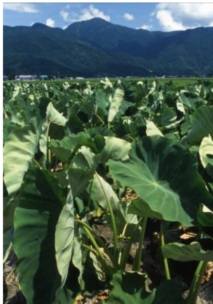
Taro fields at the mountain's base ②

Towering 1,523m over the Ono Valley, Mt. Arashima is renowned for its beauty and recognized as one of Japan's 100 greatest mountains. Known as the "Mt. Fuji of Ono," it has long been held sacred to local religious traditions, and has a small shrine at its peak, which is feared as a mysterious place normally inaccessible to people. A single viewing from the Ono or Katsuyama City areas illustrate the unique beauty it brings to the Okuestu area.