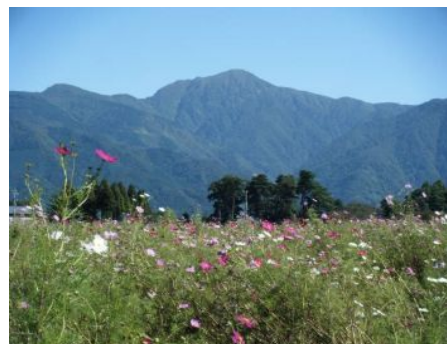
Cosmos fields set against Mt. Arashima ⑥

At the mountain's base stretch fields of taro, whose leaves and stalks grow as tall as people in September. Its springy texture and rich taste make this traditional vegetable well-liked within the prefecture.