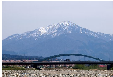
Mt. Arashima as viewed from Katsuyama Bridge ③

Towering 1,523m over the Ono Valley, Mt. Arashima is renowned for its beauty and recognized as one of Japan's 100 greatest mountains. Known as the "Mt. Fuji of Ono," it has long been held sacred to local religious traditions, and has a small shrine at its peak, which is feared as a mysterious place normally inaccessible to people. A single viewing from the Ono or Katsuyama City areas illustrate the unique beauty it brings to the Okuestu area.