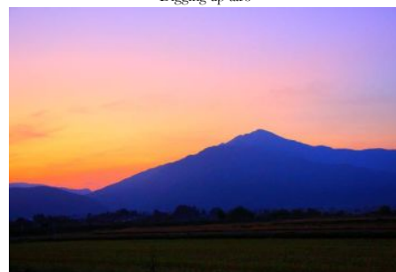
Mt. Arashima at dusk ⑤