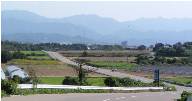
The Fruit Line, passing through northern Sakai's hill country (Jin ga Oka, Mikuni-cho, Sakai City)

At approximately 1,000 hectares, the sandy soils of northern Sakai's hills comprise Fukui Prefecture's largest horticultural area, situated 40m above sea level. Through this cuts the Fruit Line, the area's main agricultural road, and along its borders passengers can find a variety of produce throughout the year, and enjoy the brilliant colors each lend to the landscape.