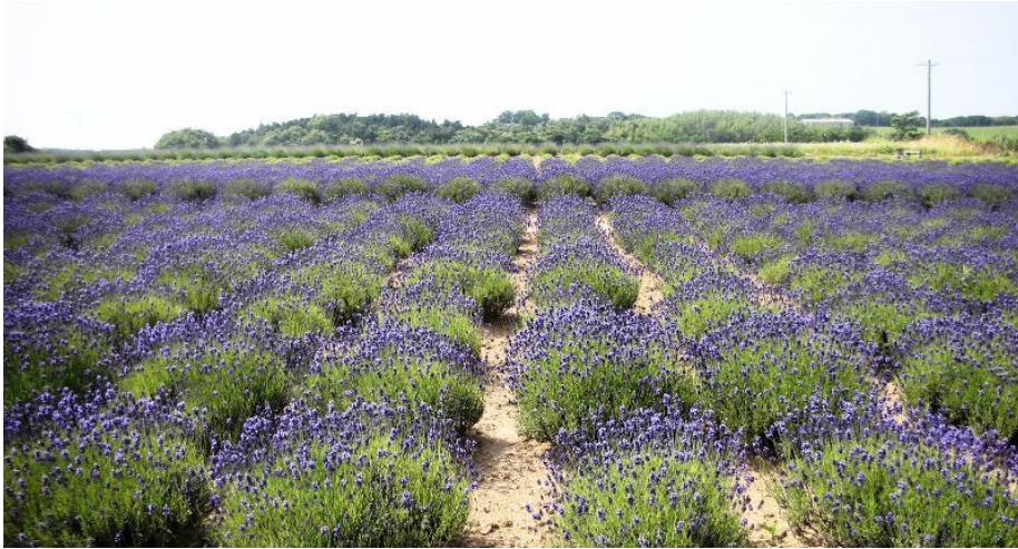
Fields awash in the rich scent of lavender (Kado, Mikuni-cho, Sakai City)