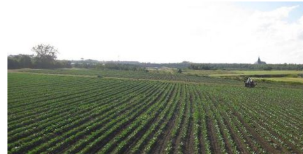
Broccoli fields (Jyoshinden, Awara City)

The greenhouses dotting these hills nurture a wide variety of melons, including earl's melon; koshi no rubi tomatoes, a medi-tomato created through cutting-edge agricultural methods; and a wide variety of other farm produce.