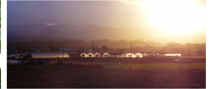
Greenhouses in the morning sun (Ieyoshi, Awara City)

The greenhouses dotting these hills nurture a wide variety of melons, including earl's melon; koshi no rubi tomatoes, a medi-tomato created through cutting-edge agricultural methods; and a wide variety of other farm produce.