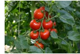
Koshi no rubi tomatoes ①