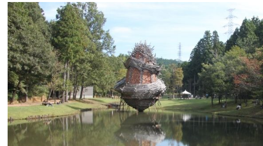
Kanazu Sosaku no Mori's waterside park (Miyatani, Awara City) ②

Nestled among the serene fields and rolling mountains is Kanazu Sosaku no Mori, comprised of eateries, and art museum, glass and pottery factories, and more. Visitors are welcome to experience all that it has to offer, be it through observation or the myriad hands-on opportunities available there.