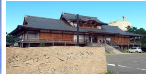
St. Rennyo Memorial Hall