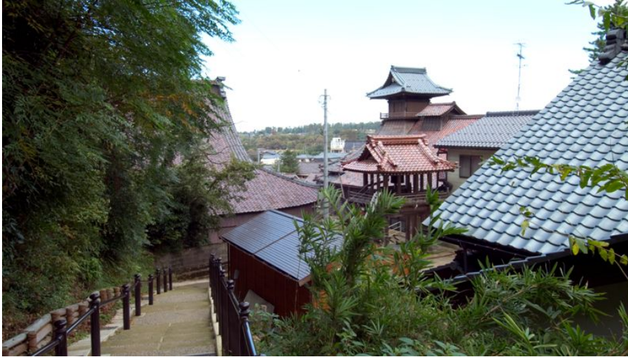
Yoshizaki Gobō branch temple, as viewed from the nearby walking path

A statue of St. Rennyo overlooks Kashima Forest from the mountain at Yoshizaki, a place once regarded as a major pilgrimage site. The branch temple of Honganji at the base of the mountain vividly recalls the area's past.