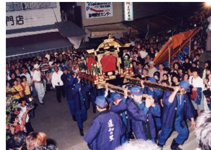
St. Rennyo Goei dōtzu, the pilgrimage carrying his effigy ③