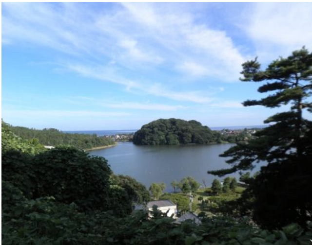
Kajima Forest as viewed from Yoshizaki Gobō Ruins (Oyama)

From the statue of St. Rennyo at the remains of Yoshizaki Gobō, visitors can see the same Lake Kitagata, its Kashima no Mori, and the surrounding forests that Rennyo and his followers viewed from their temple during the Muromachi Period.