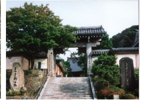
Honganji Yoshizaki Branch Temple's Enryū-mon Gate (city cultural treasure)