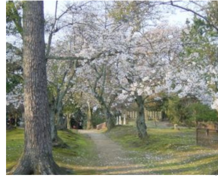
Public park at Yoshizaki Gobō Remains (nat. historical site) ①

Jōdo Shinshu has deep roots in Hokuriku, and even now pilgrims from Higashi Honganji Temple in Kyoto travel to Yoshizaki Gobō on foot, carrying with them a holy vessel housing an image of this Buddhist holy man.