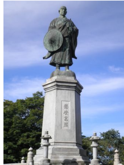
Takamura Koun's bronze statue of Rennyo